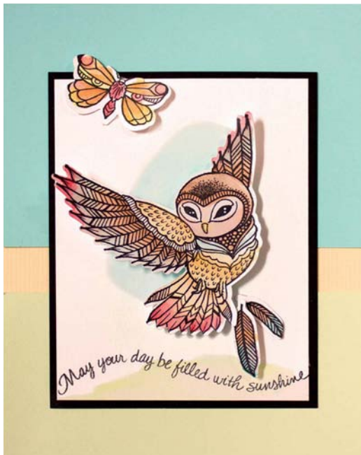
Stephanie used Owl stamp and die set ( SDS-039 ) for this charming card